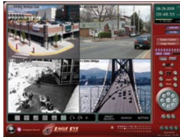
Multi-camera System Interface