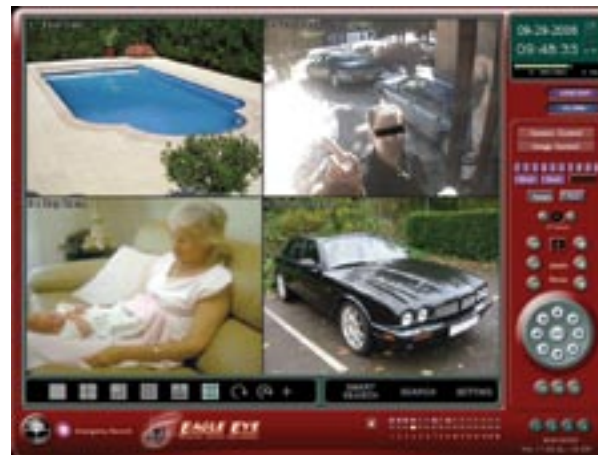
Multi-camera System Interface

*Some features not available in certain configurations.